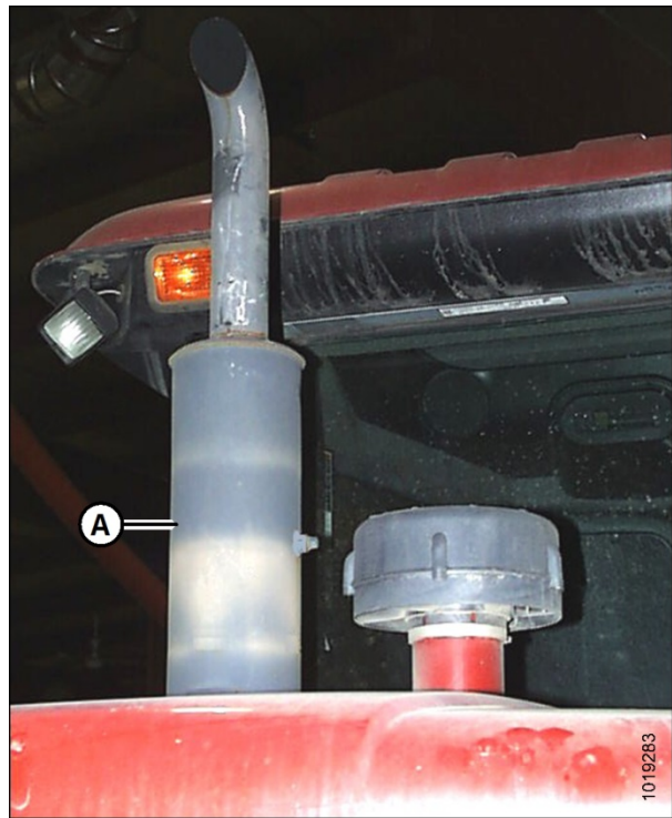
Figure 2: Existing Muffler