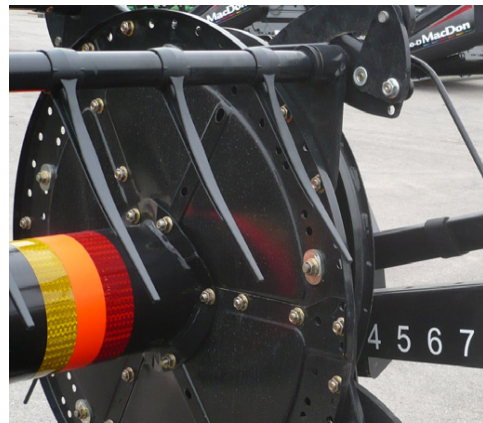
Figure 3 Reel Fore/Aft Position